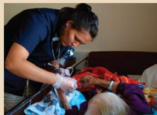
The clinical sites at area health care facilities give students invaluable experience in patient care.

Admission into the nursing program is a separate process from admission to the college. Required forms are available in January from the nursing department. Enrollment is limited and competitive. Applicants receive points based on GPA, references, work experience, awards, support course completion, and entrance exam results. Candidates will be notified by mail of admission status. An application for admission is in effect for only one year. Class selection for the practical nursing program will be made in March. If applicants who have been granted admission to the program are unable to accept their appointments, admission will be reopened to alternate candidates.