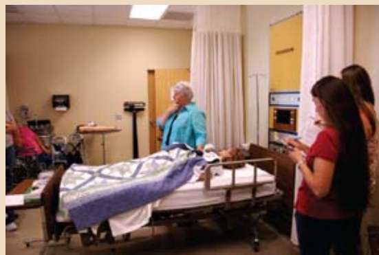
LPN students learn basic procedures in the nursing lab that will form the foundation for their nursing skills for the rest of their careers.

Our LPN and RN programs are now operating simultaneously. Eligible LPN graduates can enter the RN program without waiting for an alternate year entry. Successful applicants can work towards an associate of applied science in nursing degree leading toward RN licensure.